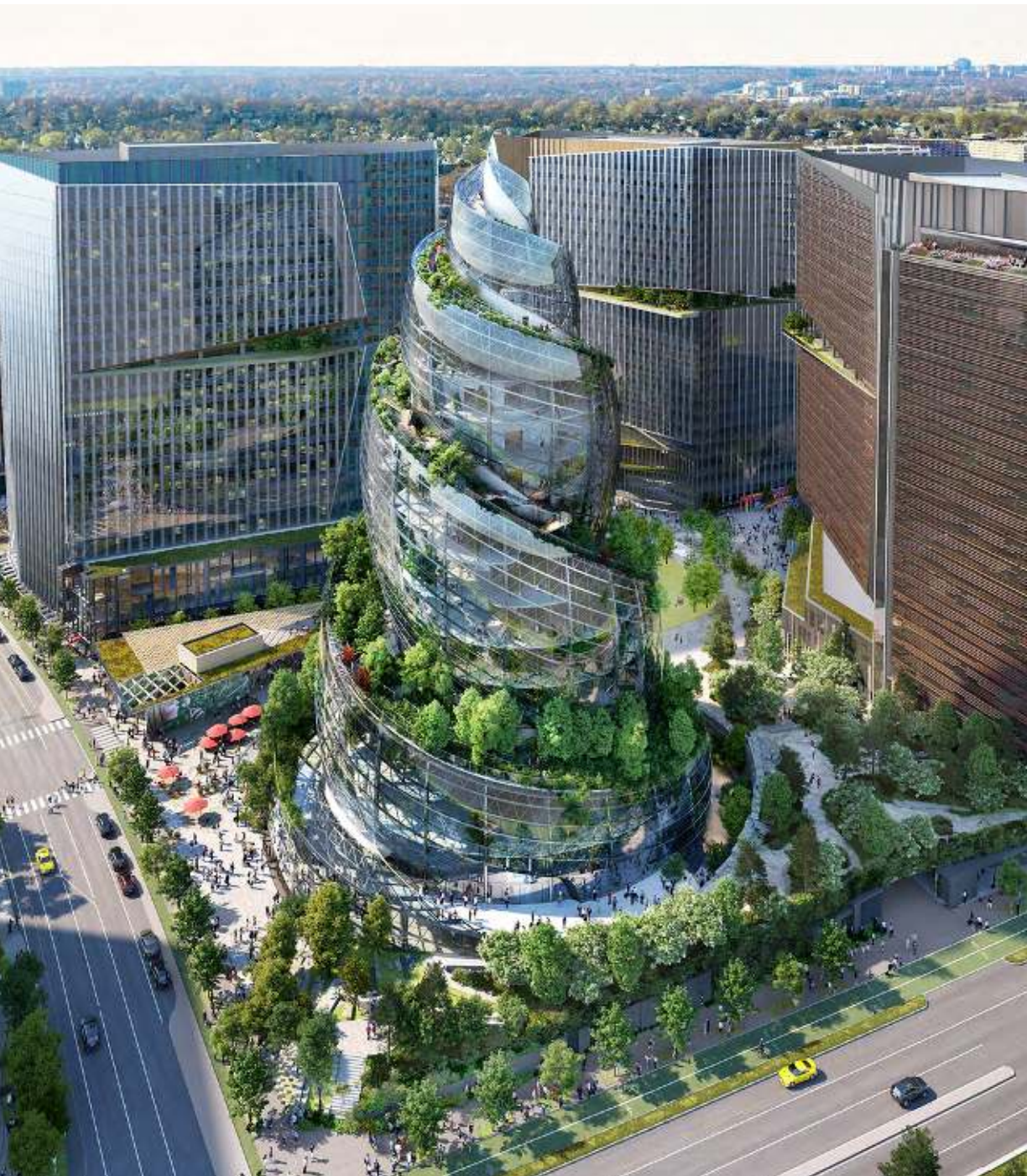
Amazon recently released renderings from the NBBJ architecture firm for "the Helix," part of its multi-billion HQ2 headquarters at the National Landing project in Arlington, Va. The project will include 2.8 million sq ft of new office space in three 22-story buildings. Over the next decade, the company expects National Landing to create 25,000 jobs.

Each local market will enjoy new revenues from the construction niches discussed in this article, so it's important for electrical contractors and other electrical professionals to be in touch with the design and architectural firms as early in the design and build process as possible to identify potential new business opportunities.