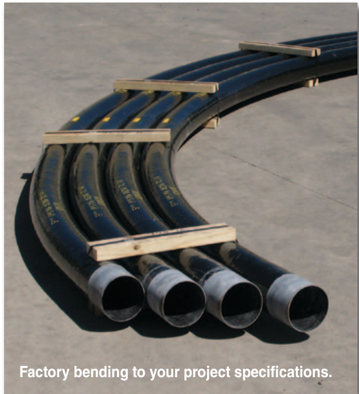
Factory bending to your project specifications.

Contact your Champion Fiberglass representative: