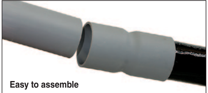
Easy to assemble